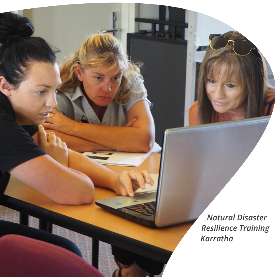
Natural Disaster Resilience Training Karratha

Food insecurity is responsible for a growing social, health, and economic burden in Australia, largely driven by poverty. The Food Relief Framework Project, funded by Lotterywest and auspiced by WACOSS, was established to review and make recommendations about better ways of delivering relief to those who experience food insecurity around the State. A Working Group was formed and extensive stakeholder and community consultation was undertaken, for us to come up with ways together about how to ensure a more sustainable sector that is best-placed to meet the needs of the people and families experiencing food insecurity. Because food insecurity is much more likely to be entrenched