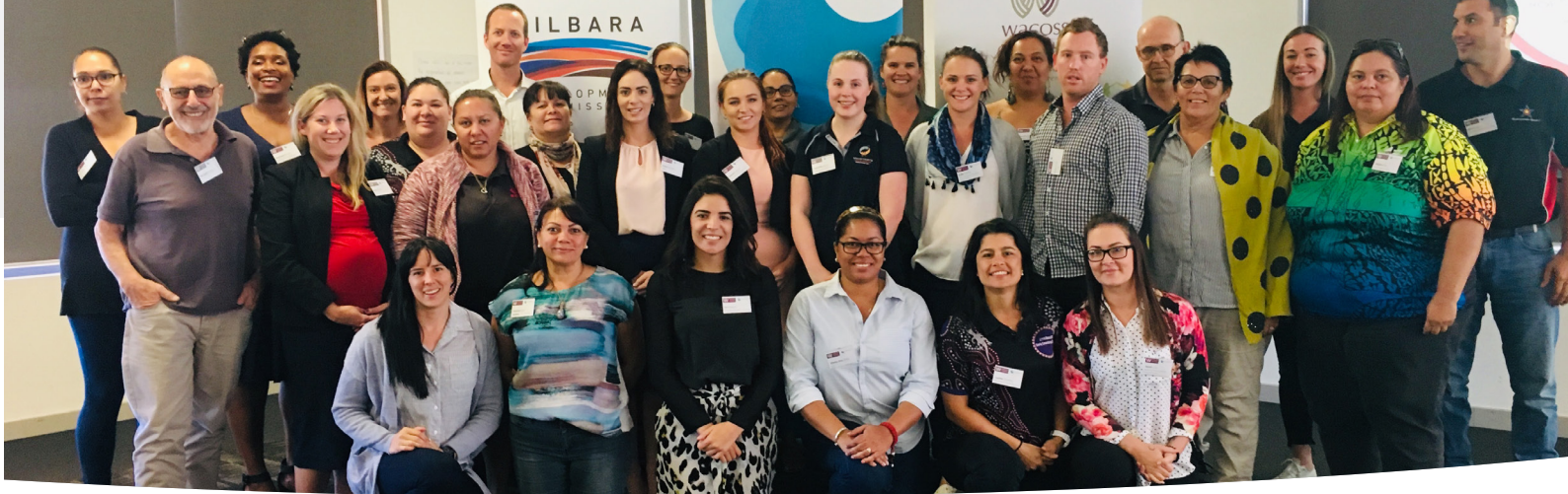
Pilbara Leadership Training Group

than an isolated emergency, we also looked at developing deeper understandings about why it exists.